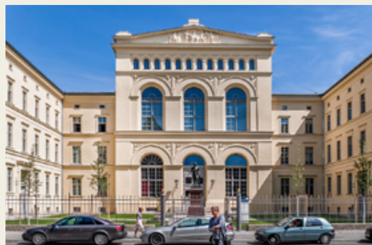
Office Berlin Mitte (HU)