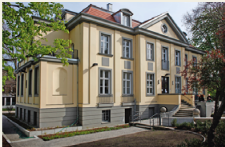
Office Berlin Dahlem (FUB)